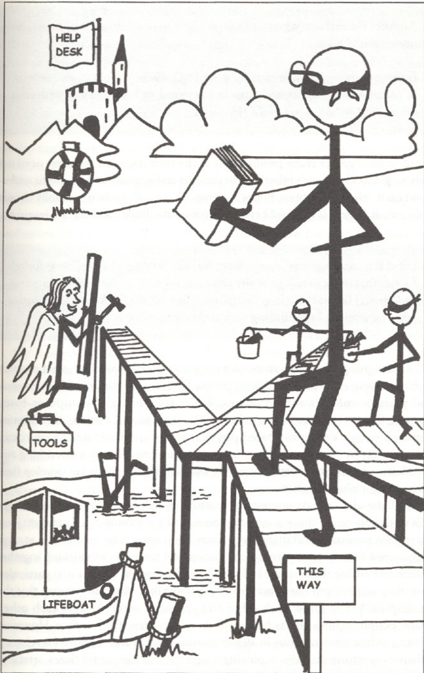
Stage 2. Here we can see Lou setting off in a journey of faith, carrying some baggage. The e-moderator is building the bridges for all the participants